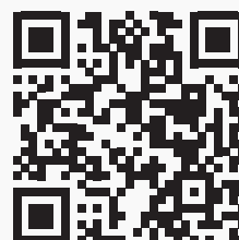
Lever Talent Acquisition Suite on ADP Marketplace

Two HR technology leaders come together to bring you the best customer experience, streamlined integrations, and a shared goal to support your HR goals and processes. Connecting premier HR management software with premier talent acquisition technology benefits organizations, candidates, and talent professionals alike.